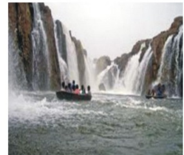
Hogenakkal Waterfalls, Tamilnadu