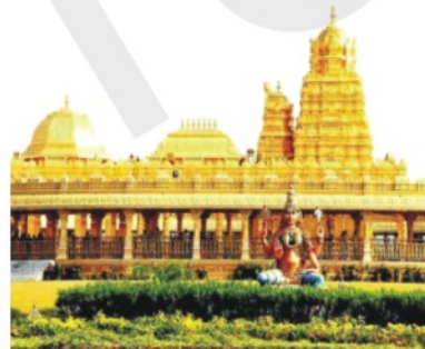
Golden Temple, Sripuram, Vellore