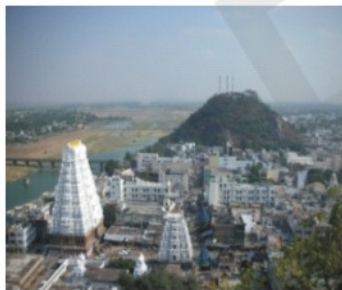
Sri Kalahasteeswara Temple, Srikalahasthi