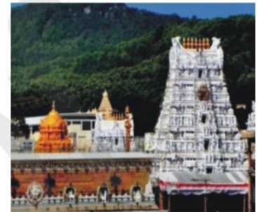
Sri Venkateswara Temple, Tirumala