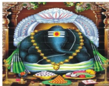
Sri Swayambhu Varasidhi Vinayaka Swamy Devasthanam, Kanipakam