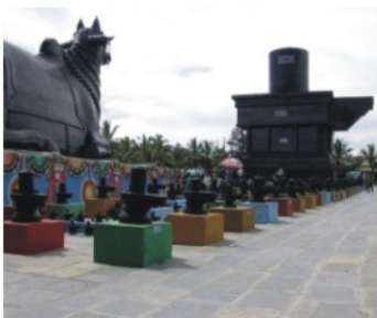
Kotilingeswara Temple, KGF