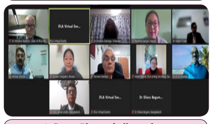
A Group Photo of all members